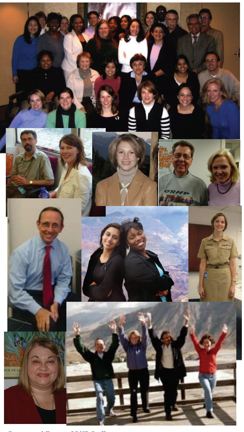
Current and Former ORHP Staff

The relationships established between the rural health research centers and ORHP continue to impact the status of health care in rural America. From the very beginning, those involved with rural health research were charged with discovering ways to use their research as practical assistance to the aims of ORHP as well as national and State policymakers. ORHP provided the initial support to work with others within the research community to create the Journal of Rural Health as a place where the work of rural health services researchers could be published in a peer-review journal.