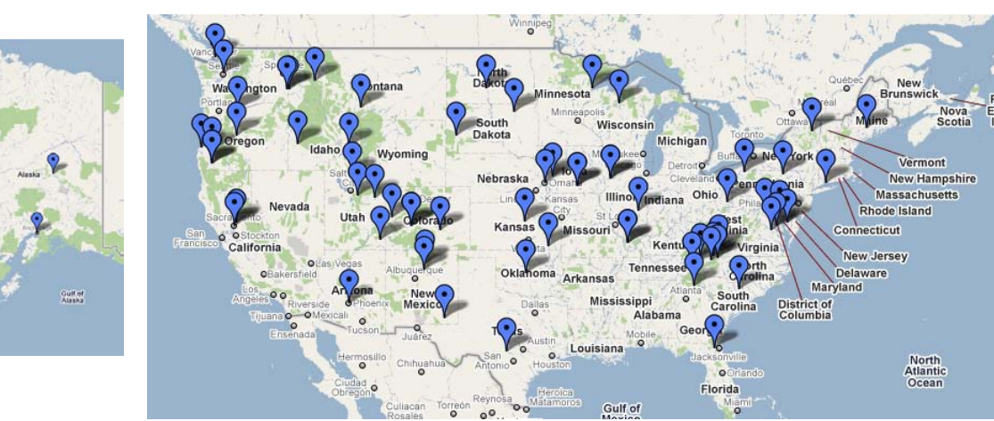
Figure 1: Locations of organizations that completed the initial survey

Sixty-nine programs from across the country completed the initial survey. The programs, representing 32 States, were spread across all four Census regions, and all nine Census divisions. Figure 1 shows the locations of these programs (note that some locations nominated more than one program, so there are fewer than 69 locations in the figure). Although there are likely substantially more behavioral health programs in the U.S. specifically designed to serve rural areas, the fact that respondents represented all areas of the country suggests the programs described in this document are somewhat representative of the types of rural behavioral health programs implemented in rural areas.