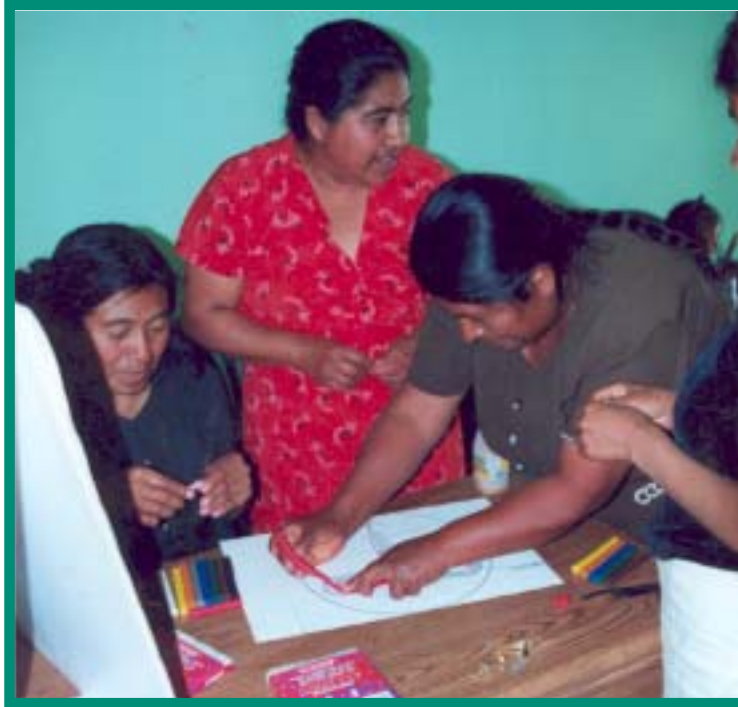
FERIA DE LA SALUD POR LA MUJER (WOMEN'S HEALTH FAIR) Hospital General de Allende, Health District 01