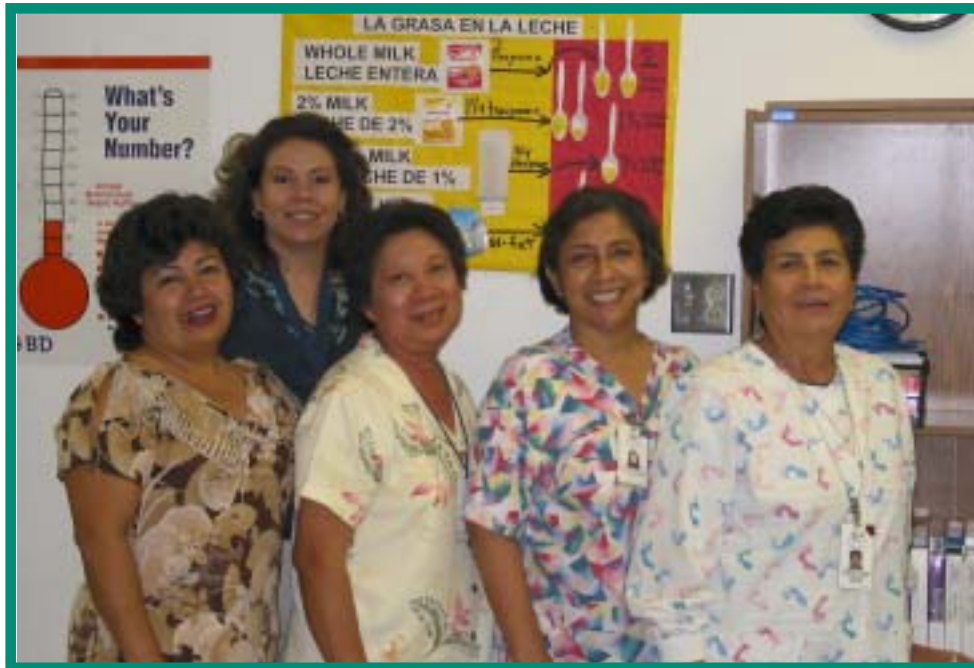
REACH PROMOTORA COMMUNITY COALITION Migrant Health Promotion, Inc.