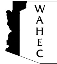
Western Arizona Area Health Education Center, Inc.